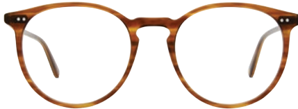
Demi Blonde 1076-51-DB