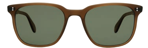
Matte Espresso/Green Grey Polar 2079-52-MESP/GRNGPLR