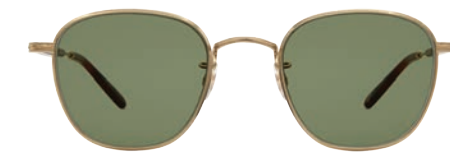
Gold-Dark Honey Tortoise/Semi-Flat Green 4052-49-G-DHT/SFGRN