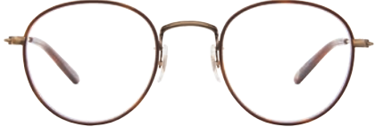
Marigold Tortoise-Brushed Gold-Dark Honey Tortoise 3011-46-MGT-BG-DHT