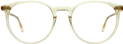
Pure Glass 1076-51-PG