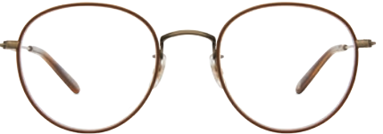
Honey-Antique Gold II-Demi Blonde 3011-46-H-AGII-DB