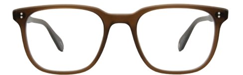
Matte Espresso 1079-50-MESP