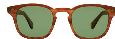
Honey Amber Tortoise/Semi-Flat Pure Green 2081-47-HAT/SFPGN