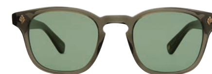
Black Glass/Semi-Flat Pure G15 2081-47-BLGL/SFPG15