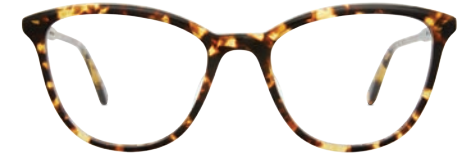
Tuscan Tortoise 1078-51-TUT