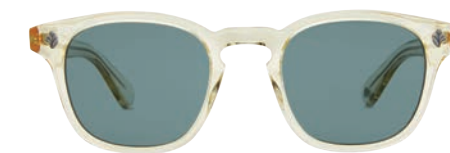
Pure Glass/Semi-Flat Blue Smoke 2081-47-PG/SFBS