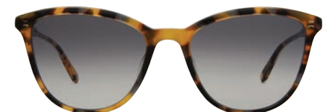
Gemini/Semi-Flat Grey Gradient 2078-52-GEM