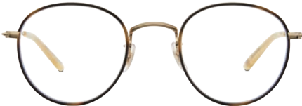
Tiger Eye-Gold-Toffee 3011-46-TE-G-TOF