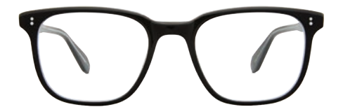
Black Laminate Crystal 1079-50-BKLCY