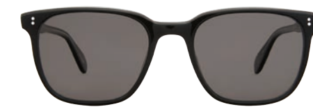
Black Laminated Crystal/Black Polar 2079-52-BKLCY/BKPLR