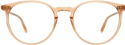
Pink Crystal 1076-51-PCY