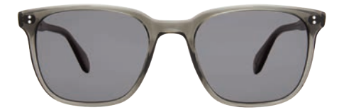
Grey Crystal/Black 2079-52-GCR/BK