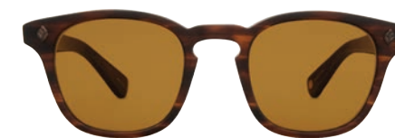
Matte Brandy Tortoise/Semi-Flat Pure Coffee 2081-47-MBRT/SFPCOF