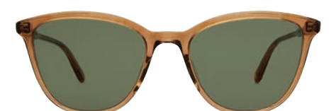
Phoenix/Semi-Flat G15 2078-52-PHX