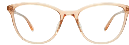
Pink Crystal 1078-51-HEN