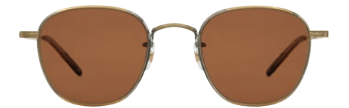
Antique Gold-Khaki Tortoise/Semi-Flat Oak 4052-49-ATG-KHT/SFO