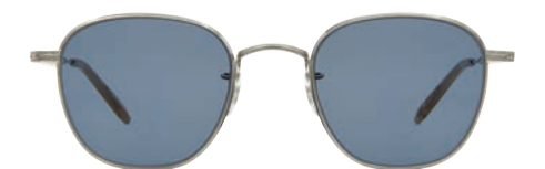
Silver-Blonde/Semi-Flat Navy 4052-49-SV-B/SFNKY