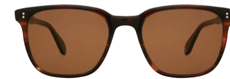
Mahogany Tortoise/Oak 2079-52-MAT/O