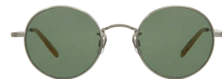
Brushed Silver-Blonde/Pure G15 4053-46-BS-B/PG15