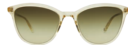
Pure Glass/Semi-Flat Olive Gradient 2078-52-PG/SFOG