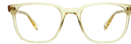
Pure Glass 1079-50-PG