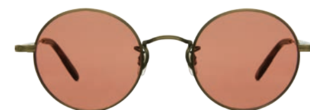
Antique Gold II-Brown Marble Tortoise/Pure Rosewood 4053-46-AGII-BMRT/PRW