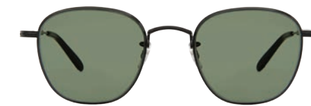
Black-Black/Semi-Flat G15 4052-49-BK-BK/SFG15