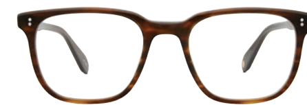
Brandy Tortoise 1079-50-BRT