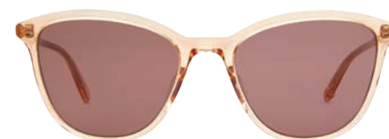
Pink Crystal/Semi-Flat Lilac 2078-52-PCY/SFLI