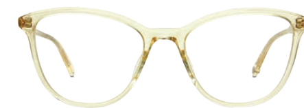
Pure Glass 1078-51-PG