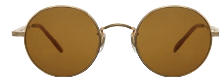
Matte Gold-Amber Honey/Pure Brown 4053-46-MG-AH/PBN