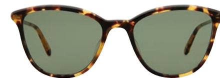
Dark Tortoise/Semi-Flat Green 2078-52-DKT/SFGRN