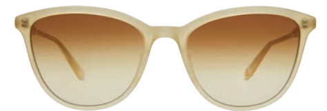
Alchemist/Semi-Flat Yellow Brown Gradient 2078-52-ALCH