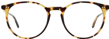
Dark Tortoise 1076-51-DKT