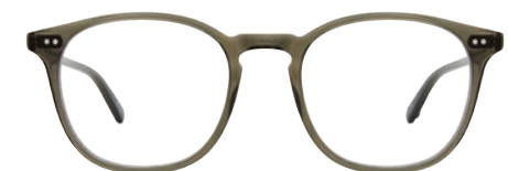
Black Glass 1077-49-BLGL