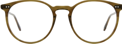
Olive Tortoise 1076-51-OT